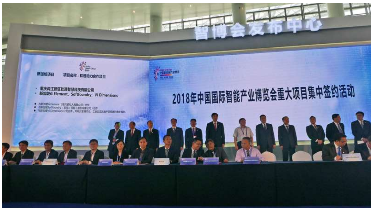
2018 年中国国际智能产业博览会重大项目集中签约活动 (2018 Smart China Expo Major Projects Centralized MoU Signing)

Singapore / Chongqing, 25th August 2018 – The first Smart China Expo 2018 was held at the Chongqing International Expo Center, China. During the signing ceremony for major projects held on the first day of the Smart China Expo, Vi Dimensions along with 2 other Singapore companies signed a cooperation agreement for the “China-Singapore Digital City Industry Alliance”. Twenty guests from national ministries, foreign governments, brother provinces and cities, well-known enterprises and the Chongqing Municipal Government witnessed the signing of the project.